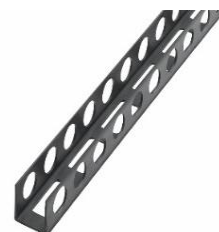
with holes at the side

Approved according to DBV specification „Abstandhalter“ DBV - c - L2/F