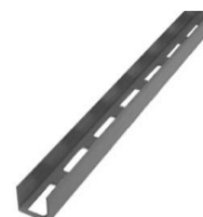
closed at the side

Approved according to DBV specification „Abstandhalter“ DBV - c - L2/F